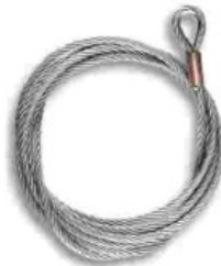
stainless wire rope Ref.: AC 850 diameter Ø 8 mm stainless steel equipped with stainless steel thimble