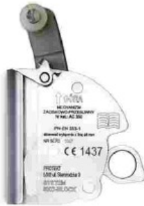
rope grab Ref.: AC 350 weight 380 g stainless steel